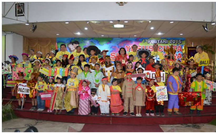
Children in west Java, Indonesia celebrate Christ's love during the Children's Spiritual Celebration at the Indonesian Adventist University on August 9. They represent the different countries of the world in their colorful international costumes.

Adventist children's ministry leaders in West Java, Indonesia use a variety of activities to encourage a more vibrant relationship with Jesus among children. On August 9, more than 700 children and 200 staff from 25 Adventist churches joined in a one-day Children's Spiritual Celebration at Indonesian Adventist University (Universitas Advent Indonesia) in Bandung.