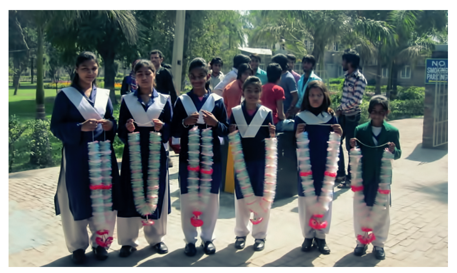
School girls at the Pakistan Adventist Seminary and College prepare to greet the visiting SSD officials.

WE THANK GOD for His blessings and care for the church work in Pakistan. There are many challenges but at the same time, there are many blessings. We now have many opportunities to hold evangelistic meetings in different cities. Most of the population lives in village areas but there are a large number of big cities like Karachi, Lahore, Faisalabad, Hyderabad, Gujranwala, Quetta and Peshawar where our church work is growing.