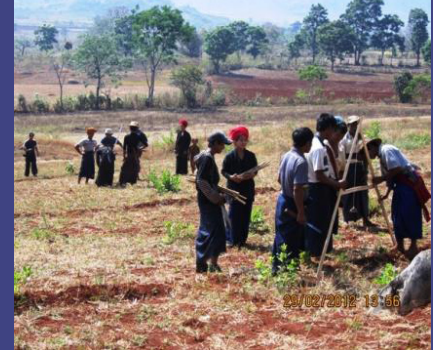
(people on sloping field): May Phyu villagers develop their challenging landscape for cultivationg maize and ground nuts using the Sloping Land Agriculture Technology Training and Model Plot Installation (SALT/MPI) programs.