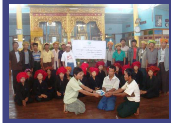
ADRA Myanmar assisted May Phyu villagers in establishing and maintaining seed and fertilizer banks for the benefit of the entire community.

However, ADRA Myanmar has provided a solution with their construction of one large rain water collection tank (about 6000gl) and 60 small water collection tanks (130gl). During rainy season, the villagers can collect water from the roof as there are now rain gutters that connect to these small household water tanks. Thus, the villagers do not need to go and fetch water any more like before. This has really saved them time which they can apply to their farm work. In addition, the ADRA Myanmar staff also taught them how to do masonry work, and how to maintain and construct more rain